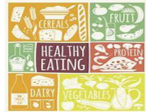
The scheme will provide a range of foods

From time to time there may be other items of higher value or long dated available at an additional cost to the £3.50.