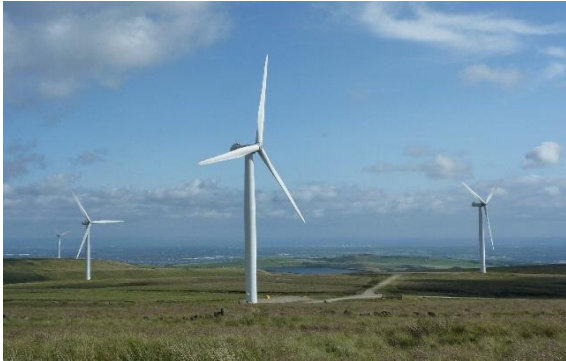
Scout moor wind farm