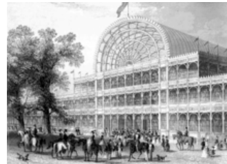
Crystal Palace- where The Great Exhibition took place