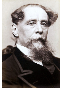
Charles Dickens (1812-1870)