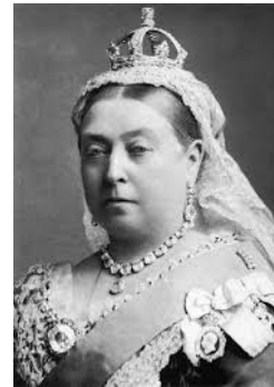
Queen Victoria 1819-1901